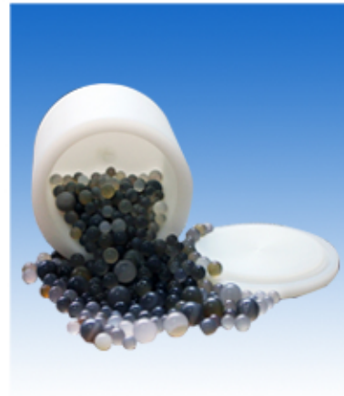
Nylon planetary mill jar with agate balls

Nylon planetary mill jar is a kind of high quality grinding jar which does not contain any metal impurity. It is the best option for milling all kind of metal and high level pigment. Nylon mill jar is often widely applied in many industries such as noble metal, electrical ceramics , magnetic materials, pigment coating, and so on.