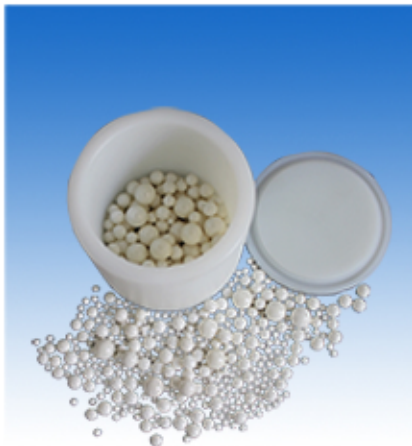
Nylon planetary mill jar with zirconia balls