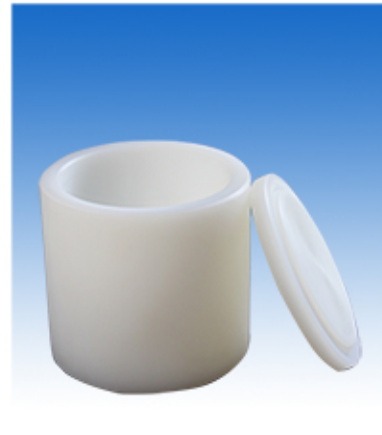
Nylon Planetary Mill Jar