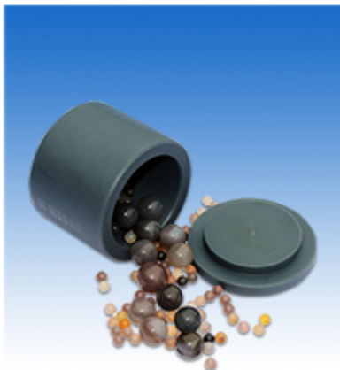
Tempered Nylon Planetary Mill Jar