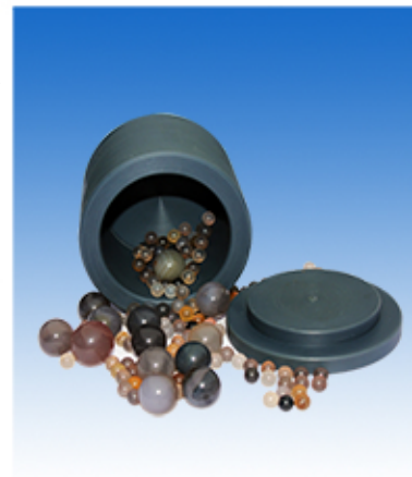
Tempered Nylon Planetary Mill Jar

Tempered nylon planetary mill jar is a kind of modified nylon jar by mold casting and integral forming, which has excellent performance in wear resistance, It is a kind of preferred mill jar for planetary ball mill duo to its durability.