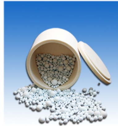
Corundum Planetary Mill Jar

Corundum, this name comes from India and it is a kind of mineral name. its hardness is only less than diamond and is mainly used for grinding all advanced materials, Corundum mill jar matched with zirconia balls is the best and classical solution for wear resistance. We'd like to remind that although corundum is very strong in hardness, it is easy to be broken. Therefore, you are requested to prevent from falling down to the ground or high strength impact to avoid break when using it. Any size of this kind of vacuum mill jar can be ordered and customized according to customer's requirements.