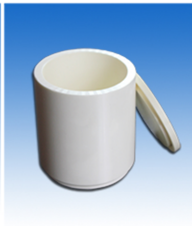
Corundum Planetary Mill Jar