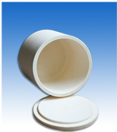
Corundum Planetary Mill Jar